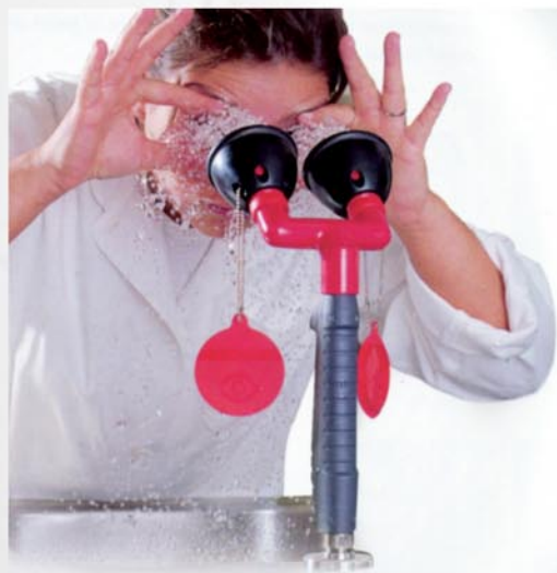
Table mounted eye shower with two heads