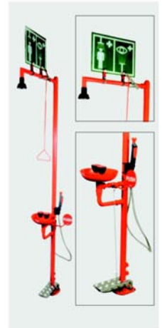
Broen Emergency foot operated body and eye shower