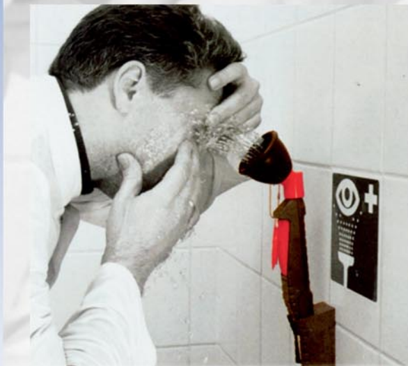
Wall mounted, trigger operated eye shower

Fast and effective first aid Broen Redline is a complete range of Emergency Showers and Eye Washes, which are principally used in laboratories and other areas where there is a high risk of accidents in the form of burns, scalds and acids injury.