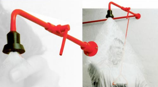
Wall mounted body shower