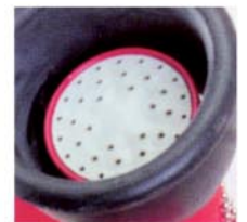
Special shower head for optimum water dispersion

For comprehensive product range and specification information please contact us for a BROEN REDLINE Emergency Showers and Eye Washes catalogue